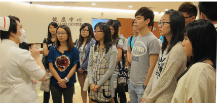
St. Paul's Hospital 聖保祿醫院

Students will participate in site visits that cover government sectors, private sectors and non-governmental organisations to explore the students' perspective on professional public health practices.