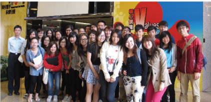
Hospital Authority 醫院管理局

學生將會被安排到不同地點參觀，包括政府部門、私人機構和非政府組織，藉此令學生掌握專業公共衛生的實踐。