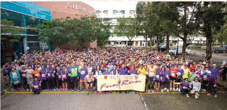
Fun Run 2016