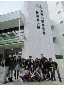
Mental Health Association 香港心理衛生會

學生須在導師督導下，為某一特定公共衛生議題進行專題研究及須完成100小時的實習工作。這是寶貴的學習經歷，可加強學生的理解及分析能力，加強研究和解難技巧。