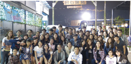
Teacher-Student Gathering 師生聚會

本院鼓勵學生積極參與校內校外的課外活動，讓他們能夠盡展潛能，發揮無窮創意，從而達致均衡的全人發展。