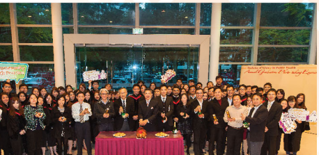
Graduation Photo Day 畢業生拍照日