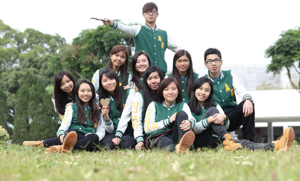
Student Society 學生會

Students are encouraged to participate in various internal and external activities to fully explore their potentials and creativity, as well as achieve whole-person development.