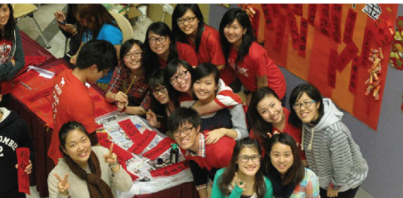
Spring Dinner 春茗